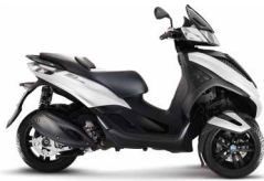
MP3 YOURBAN LT 300 SPORT