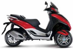
MP3 YOURBAN LT 300